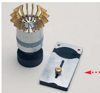
Base plate included

For other assortments and a complete selection of plastic, mineral, and sapphire crystals see our Horological Products Catalog or go online at www.julesborel.com .